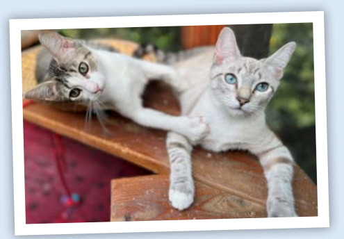
BABY PANCAKE (LEFT) & PEACHES

Peaches and Pancake were adopted as kittens two years ago. They were happy and healthy with their new dad, and we considered the adoption successful. Recently we were contacted by our local public shelter about two cats taken there after the death of their owner. Because of their microchips, the shelter was able to determine the cats were adopted from ARCF. It was a shock to learn that this young man who adopted Peaches and Pancake had suddenly passed away, but of course we quickly retrieved the cats. We expected they would need some time to adjust, so