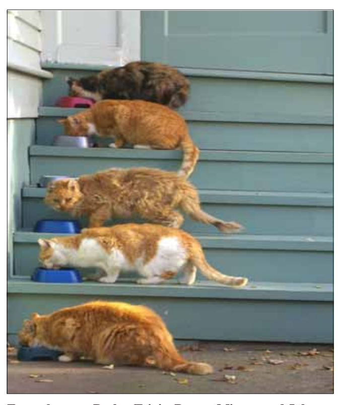
From the top: Pasha, Trixie, Poppy, Mimzy, and Johnny.

We all know about the plight of feral cats—the cats who won't let humans come near them or touch them. They don't live very long. They have hard lives. Most of them live in a constant state of fear. Most of them are feral because a human abandoned them or their parents.