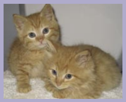
Zoe & Míles