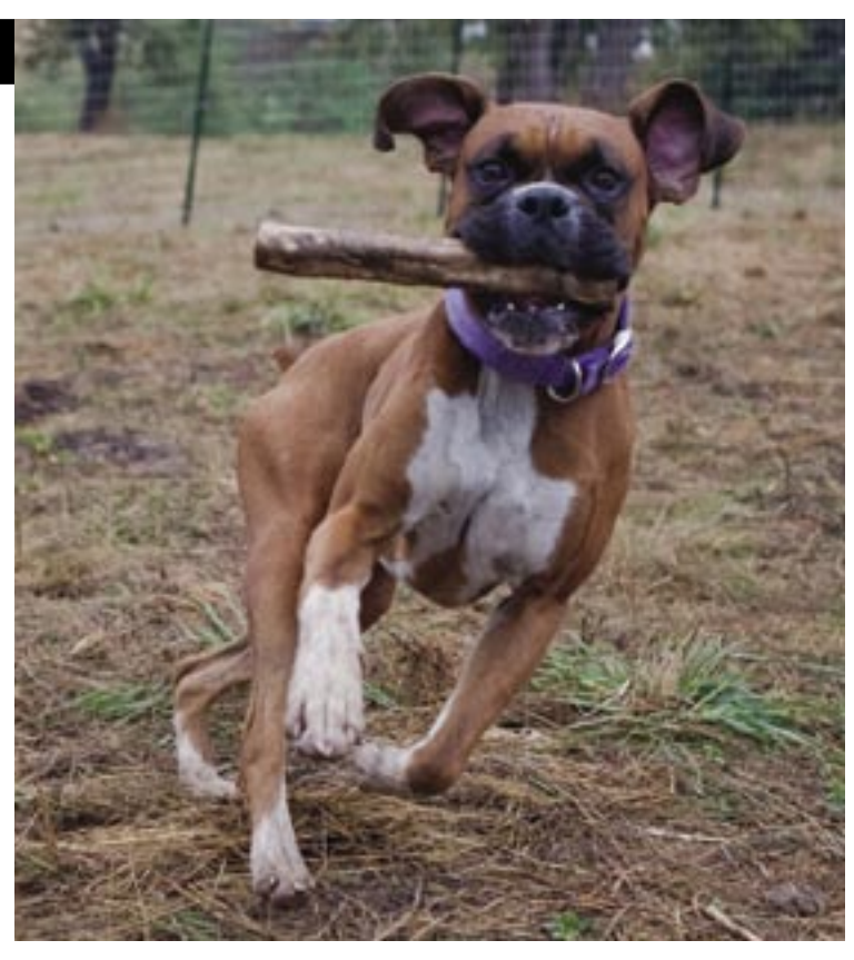
Cooper enjoys a safe place to run and play.