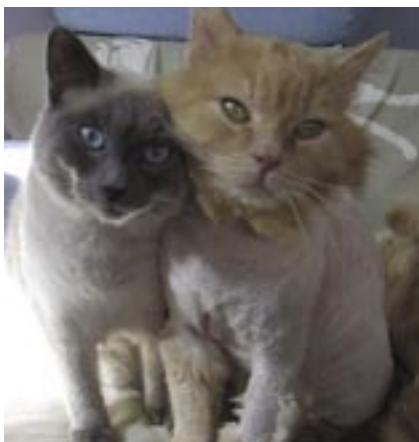
Duncan and Dudley

The guys are doing very well and have really settled in. We now have a nice routine and if they get a good play before bedtime, they allow me to sleep until 5 am! They are super friendly to visitors and they keep us entertained.