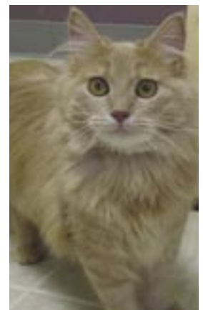
Top: Lorenzo and Maurice play hard, then knock off for nap.