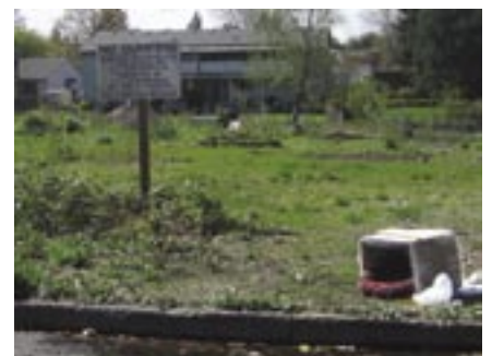
The vacant lot and box where our family was abandoned.