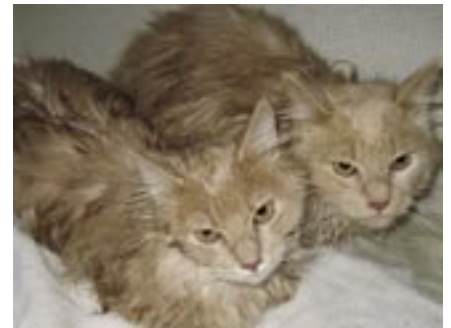
Daffodil and Maurice warming up after their baths.