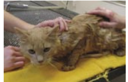
Maurice isn't too sure about this bath idea.

This group has become very bonded through their ordeal, and we will place them in pairs in their permanent homes. They have completed all their veterinary requirements and are ready to meet their new families. Please visit our website or give us a call if you'd like to meet these special kitties.