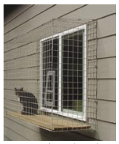
A símple wíre mesh enclosure built around a window.