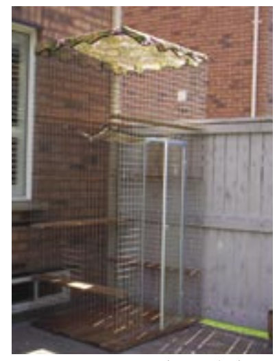
Another simple design to build yourself or order ready-made.

These so-called Catios are getting a lot of attention lately, including a recent feature in the New York Times. We're showing you a few examples in our photos here. There are now many sources for purchasing ready-made enclosures, plans for building them yourself, and some companies will even come to your home and build an enclosure to your specifications.