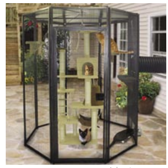
More elaborate, with tunnel from window. Available for purchase in various configurations.