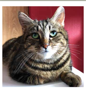
TOP: BRAND NEW BABIES; SOPHIE

return Sophie to her home once they were weaned. We arranged to pick her up the next day.