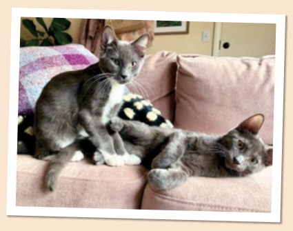
CACIO (LEFT) & PEPE

They are so happy, funny, and sweet. I've had all visitors give them a treat