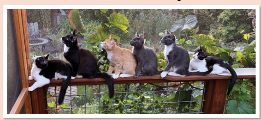
SIX "K" KITTENS BUG HUNTING IN THEIR CATIO

Just as summer began we were asked to rescue a litter of six kittens born under a porch in SE Portland. With the help of their caregiver, we quickly scooped up the kittens and humanely trapped their parents. Momma cat and the babies spent the next few weeks in our foster home, while Daddy made a quick trip to the spay/neuter clinic, so he could be returned to his home territory to wait for momma to join him when her job was done. But Daddy cat turned out to be Auntie cat! She was helping care for the kittens, while their actual daddy apparently skipped town. Tomcats are so unreliable about child support!