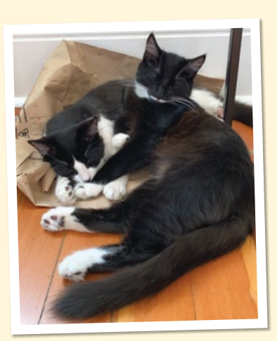
FRANKIE (LEFT) & RAZZ

We are so very in love with these little clowns! We have given them new names. Kiwi is now The Great Razzmatazz—Razz for short. He's chill, keeps to himself, but is also very insistent when he's ready for attention and affection. Kickstand is now Frankfurter Hot Dogs—Frankie for short. He is perpetually curious and loves to fall