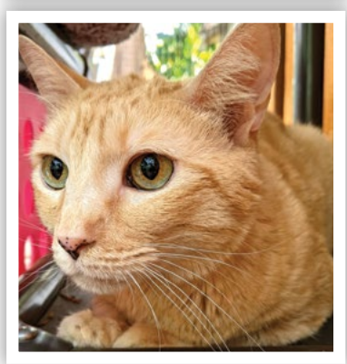
FROM TOP: TIKI; TOBY; JAMES; MORRIS

except for two grays. We'll continue to monitor the situation to quickly TNR any newcomers with potential to start the cycle again.