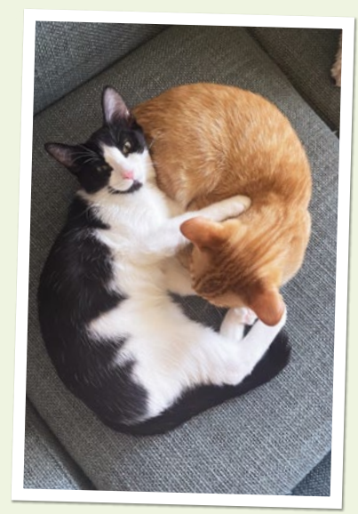
LOKI (LEFT) & LEO

Where one goes the other is sure to follow—they love being close to each other. Loki's favorite pastimes: sitting on the window sill while gazing outside, snuggling Leo, and playing with her favorite golden ball. Leo's favorite pastimes: exploring every nook of the apartment, playing