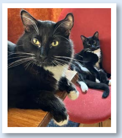
JARVIS (LEFT) & MAPLE