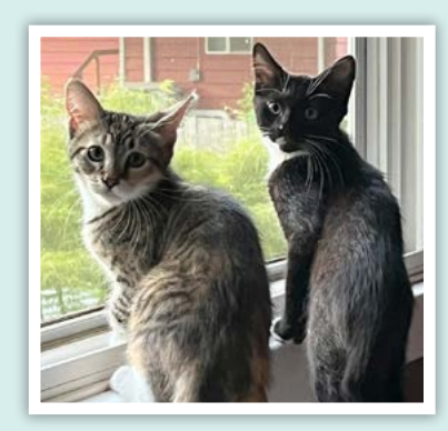
KITKAT (LEFT) & MANGO

Our dogs go in and out multiple times a day and both cats REALLY want to join them, but we are careful not to let them escape. We have had no real problems, just some adjustments. It was touch-and-go with Kitkat and the dogs as