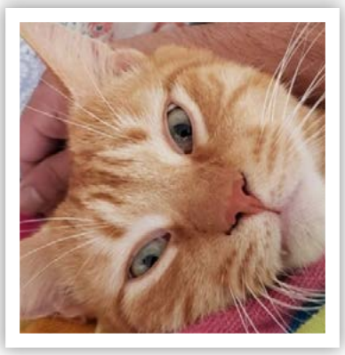
FROM TOP: WYNONNA; VANILLA; ZELDA; BRUNO

2 | Animal Rescue & Care Fund www.pdx-petadoption.org