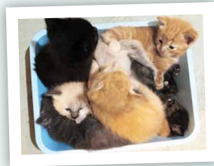
TINY Q BABIES!

Last summer as we were trapping a colony of about 15 cats in SE Portland, we discovered a momcat with six brand new babies in the backyard of a vacant home. They became Queen Bey and the “Q” litter: Q-tip, Quest, Querida, Quint, Queso, and Quintana. Sadly, Querida didn’t survive, but not long after her passing we were called to rescue a young kitten abandoned in a motel room. We introduced her to the Q kittens, called her Quiche, and she immediately became one of the family. Here are a couple of updates from their new families: