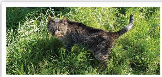
CLOCKWISE FROM TOP: FAWN & BABIES; FAJITA, EUDORA; MR. KITTY