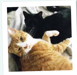
COLBY (LEFT) & RAVEN