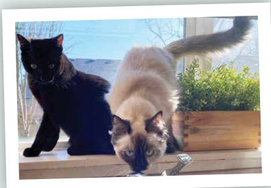
BELLA (LEFT) & LUNA