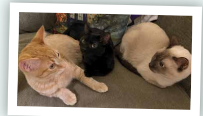
WASH, ZOE, & PIPPIN