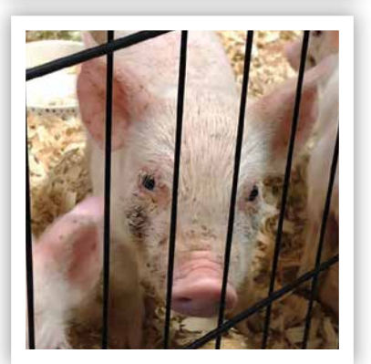
FROM TOP: MELODY; HARVEY; CHARLOTTE; PIGGIES

who asked if they could also take three orphaned piglets . The rescue wasn't prepared for additional guests, so we provided