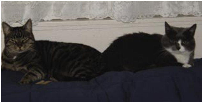
Tara (left) and Smudge (right)

Would you love to have the companionship of a pet, but now is just not the right time to make that kind of permanent commitment? Being a foster home could be the perfect solution. We are always looking for good foster homes, especially for those animals that would prefer to be single pets. Please contact us if you would like to provide a loving foster home.