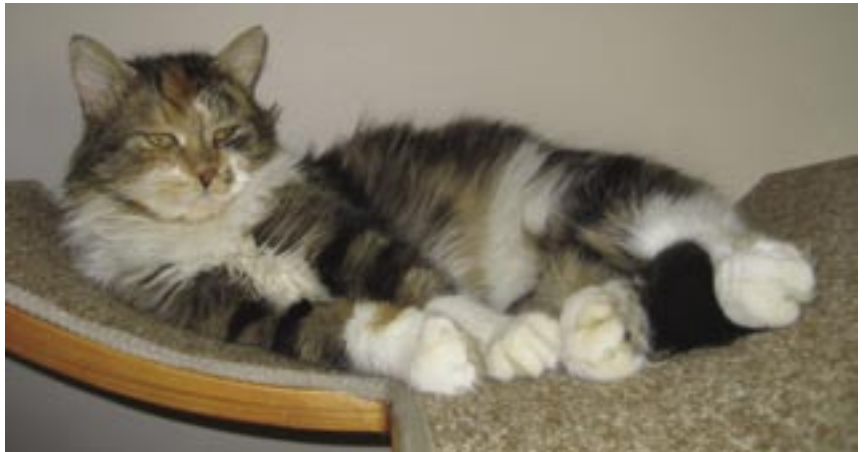
Fern, ready for her adoption!