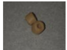
Top: proper positioning. Bottom: pill gun and pill pockets. Our thanks to Broadway Veterinary and Rose for the demonstration in our photo.

Some people prefer to coat the pill with a bit of butter or cream cheese, which may help smooth the journey a bit more. Some veterinary techs we know swear by a dab of Easy Cheese (sprayed out of a can) as the perfect pill coating, followed with a squirt of water.